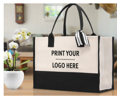
Sample for demonstration, not the actual bag