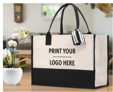
Sample for demonstration, not the actual bag